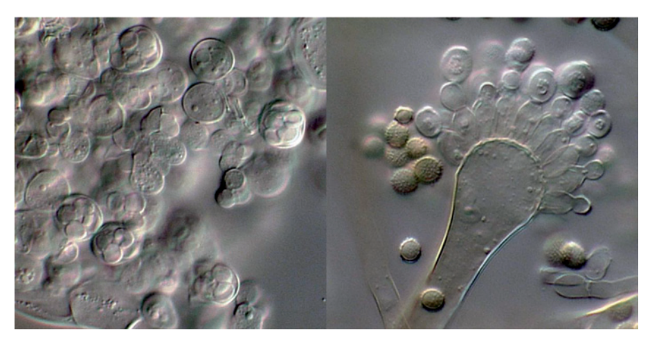
Figure 1 | Two names, one fungus. Eurotium herbariorum is a pleomorphic fungus that has a sexual phase, reproducing by ascospores (the teleomorphic form; left), as well as a conidium-producing asexual phase (the anamorphic form; right) that has been named Aspergillus glaucus.

and Penicillium camemberti and Penicillium roqueforti (used to make Camembert and Brie, and Roquefort cheeses, respectively). However, Penicillium spp., as traditionally delimited, are paraphyletic as well as pleomorphic, so these well-known species cannot all remain in this historic genus<sup>15</sup>.